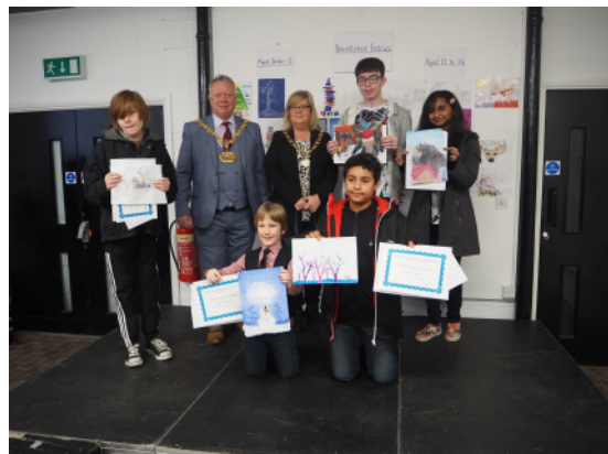
The Mayor and Mayoress of East Staffordshire and the Prize Winners.